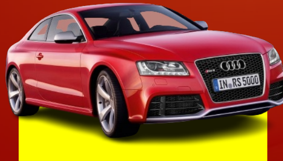
50,00,000 Business Car (DP) Worth ₹1,00,000