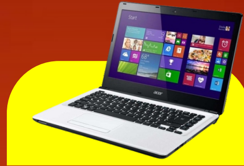
10,00,000 Business Laptop Worth ₹20,000