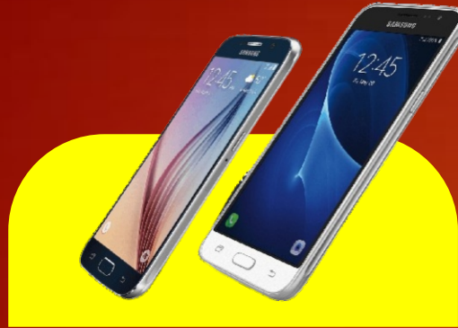
5,00,000 Business Smart Phones Worth ₹10,000