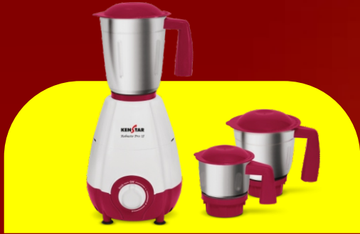
2,00,000 Business Mixer Grinder Worth ₹5,000