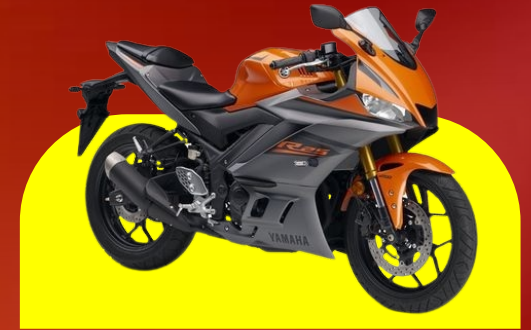
15,00,000 Business Bike (DP) Worth ₹30,000