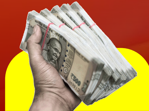
1,00,00,000 Business CASH or LAND (60:40 Ratio) ₹3,00,000