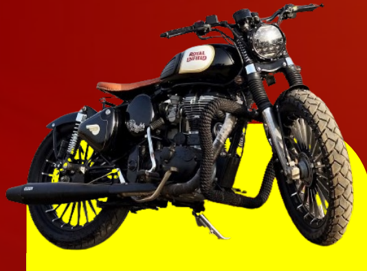
25,00,000 Business Bullet (DP) Worth ₹50,000